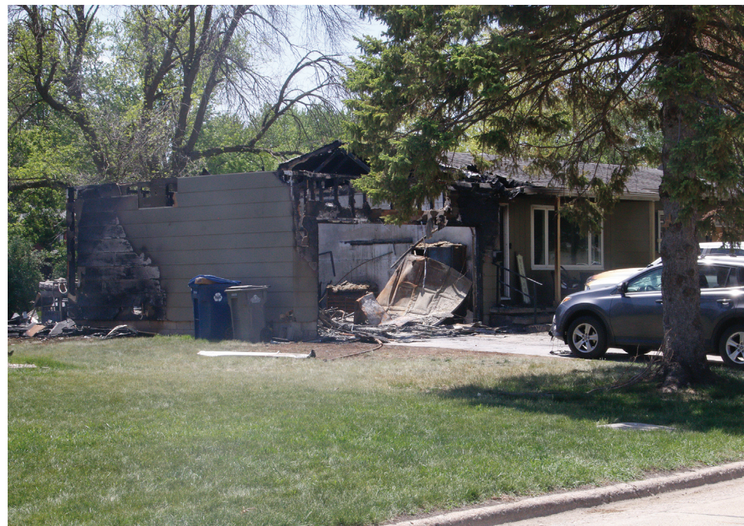
Garage and attic area of a home sustained significant damage in an evening fire on Wednesday, May 13, on East 19th Street. No injuries were reported, according to the Spencer Fire Department.