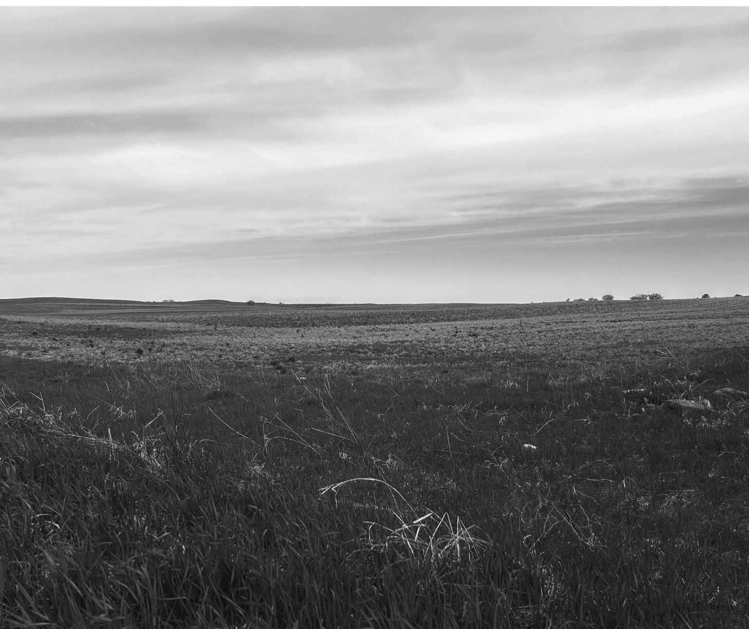
The Reed Farm, east of Arnolds Park and directly north of the Waste Management lot, covers roughly 160 acres of land. It was recently acquired by the Iowa DNR for a restoration project in collaboration with Ducks Unlimited.