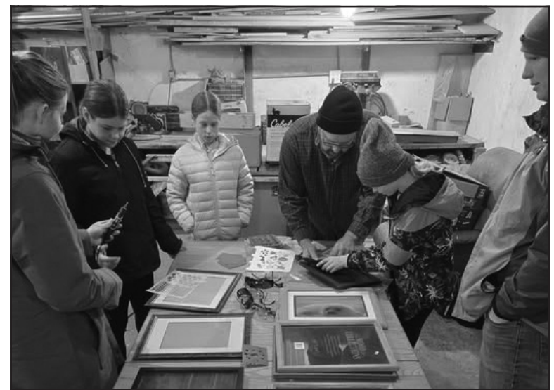
Members learning how to use a Dremel to etch designs and quotes onto glass picture frames for the fair.