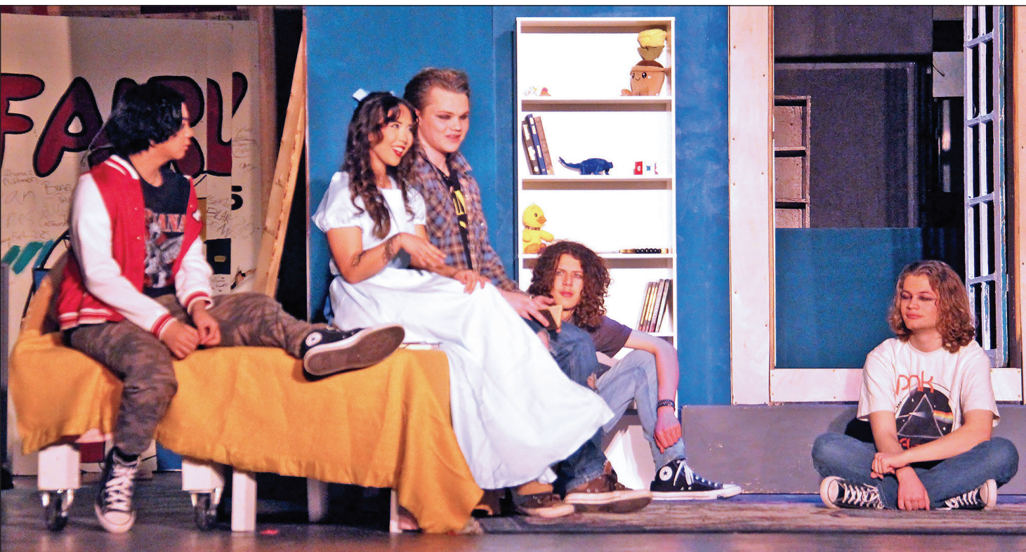
The Charles City High School Drama Department is getting ready for its spring production. "Lost Girl," a "Peter Pan"-inspired story exploring the aftermath of Wendy's adventure in Neverland, will be performed at the Charles Theatre on Saturday, April 4, at 2 p.m. with a second showing at 7 p.m.