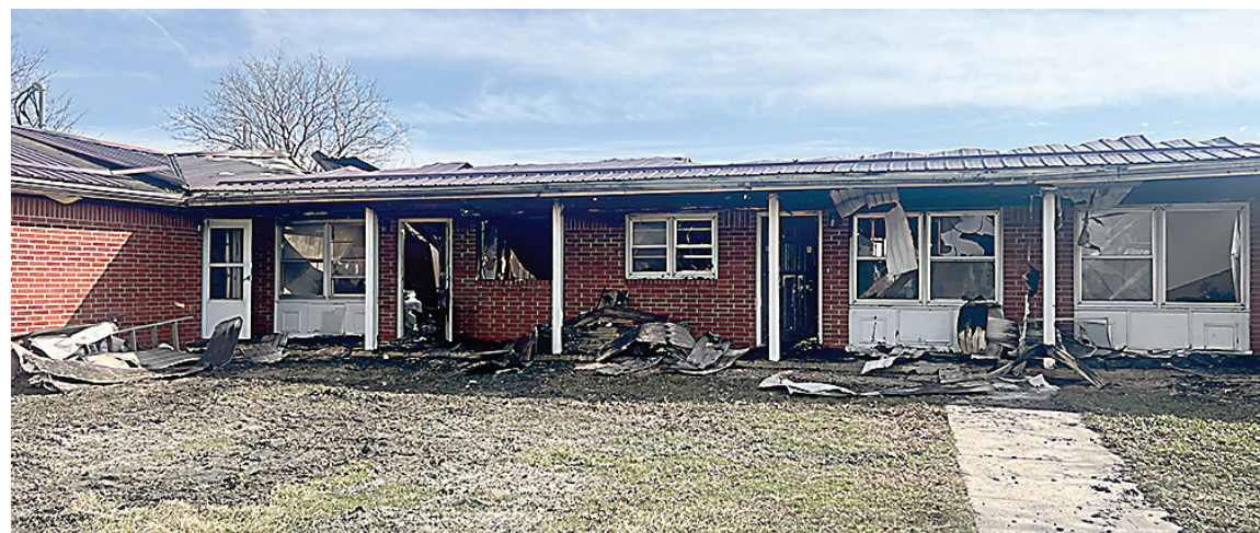
What remains of the apartments on the east side of Rudd, referred to as the old manor, after early Sunday morning's fire.

and Floyd responding. Thankfully, everyone got out safely and there were no injuries. Sunday afternoon, flames could still be seen popping up in the ceiling of one of the apartments and a fire alarm could still be heard beeping. It is not known how many people have been displaced by the loss of the structure.