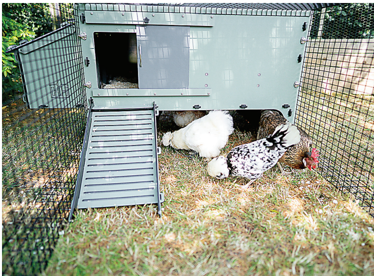
Hoover's Hatchery's new Lean-To Easy Clean Chicken Coop built from recycled plastic.