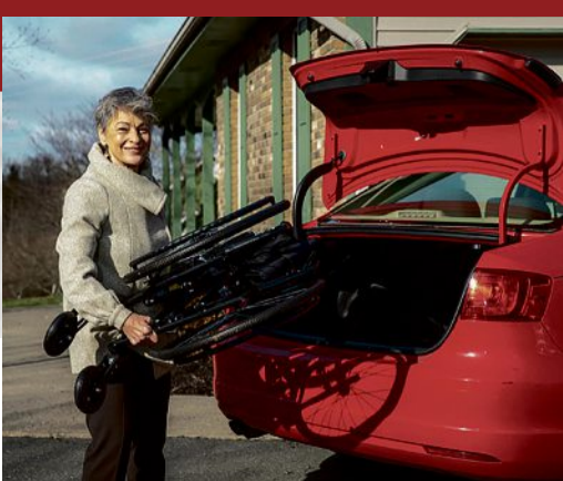
Easy to Transport and Store