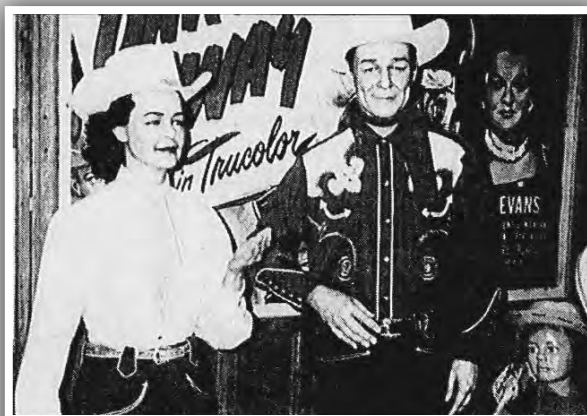
The Roy Rogers section of the Dumont Museum.