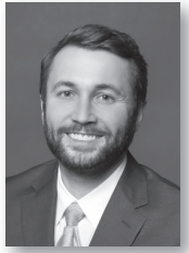
YOUR CAPITOL VOICE

This week we passed a piece of legislation reforming the Governor's emergency powers. This is a bill for which I have been an advocating for over five years. The Covid-19 pandemic revealed just how easily a Governor can overreach. I thought Governor Reynolds exercised restraint that other Governors did not, but you did see vast overreach in states like California, Illinois and Minnesota. People's constitutional rights were impeded. This bill ensures that this will never happen in Iowa regardless of whether a Democrat or Republican is in charge. A Governor's powers, regardless of party, are NOT absolute and cannot be used to suspend the fundamental rights of Iowans.