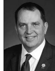
Rep. Michael Bergan

homeowners aged 65 and older with homes valued at $350,000 or less. Senate approach: Proposes changing the state's "rollback" system (which limits the taxable portion of property value) and increasing the homestead tax credit to 50% of a home's taxable value. As part of Iowa's America 250 celebration, commemorating the 250th anniversary of the signing of the Declaration of Independence, the Iowa Department of Education is offering an exciting new webinar series for K-12 educators across the state. Starting Jan. 26, Iowa educators joined the Iowa America 250 webinar series, highlighting important historical events related to the founding of America that can help guide classroom instruction and thoughtful student discussion. The schedule of dates and topics for the webinar series are listed below. All webinars will meet from 4-5 p.m. on Zoom. Full details on the upcoming webinar series can be found on the Department's Iowa America 250 Webinar Series and Recordings webpage. Iowa Workforce Development (IWD) is opening a new round of grant funding today to help employers advance promising summer internship programs for Iowa's youth. The Summer Youth Internship Program exists to help generate