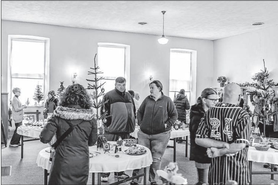
Visitors shop at the bazaar before the start of the 34th Annual Amana Church Cookie Walk Saturday, Dec. 6 at the Amana Church in Main Amana. The event was part of the Amana Colonies Prelude to Christmas.