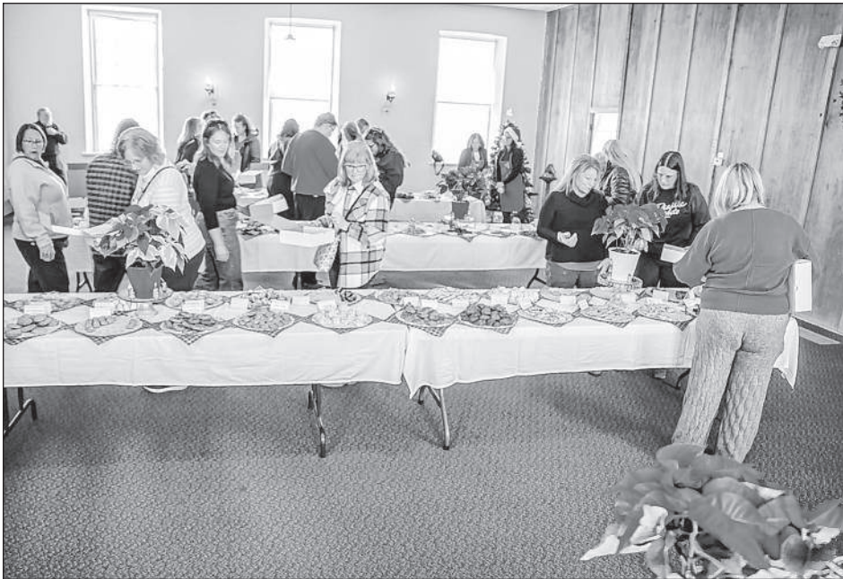
Visitors to the Amana Church Cookie Walk Saturday find lot to choose from. The event was part of the Amana Colonies Prelude to Christmas.