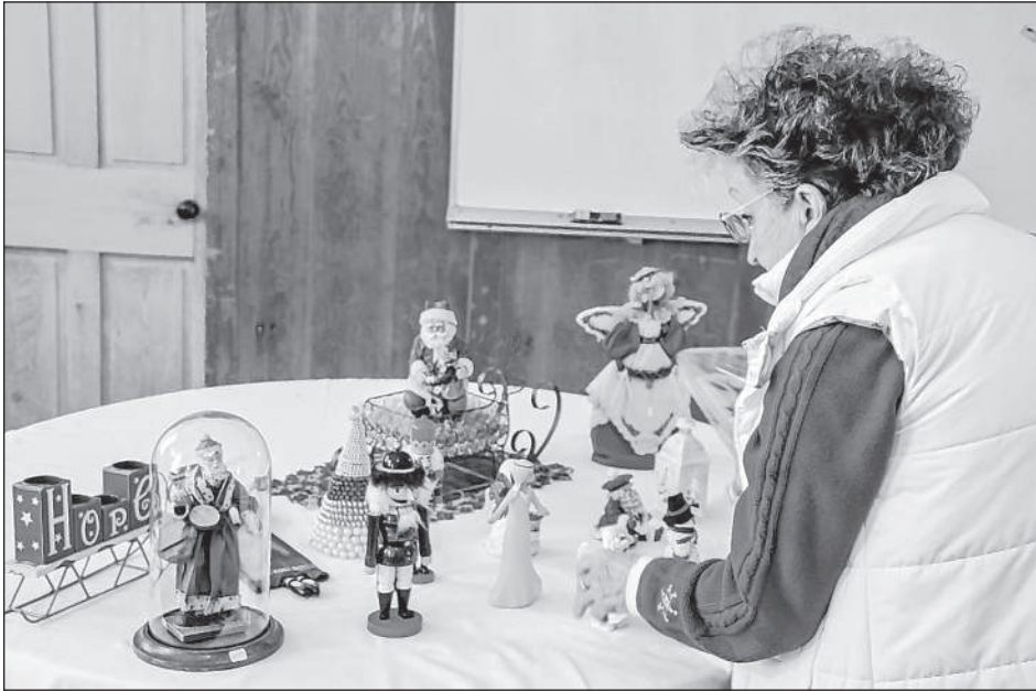
A visitor to Amana looks over the Santa table at the 34th Annual Amana Church Cookie Walk and Christmas Bazaar Saturday at the Amana Church in Main Amana.