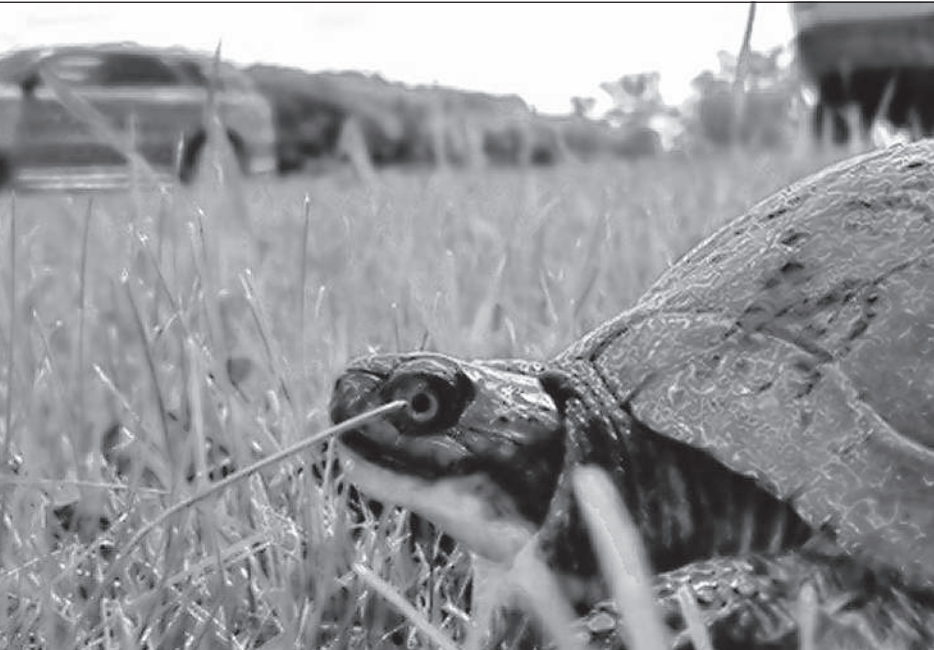
Blanding's turtle, a threatened species in Iowa, crosses a road.

SAFE STEP. North America's #1 Walk-In Tub. Comprehensive lifetime warranty. Top-of-the-line installation and service. Now featuring our FREE shower package and $1600 Off for a limited time! Call today! Financing available. Call Safe Step 1-844-376-4154