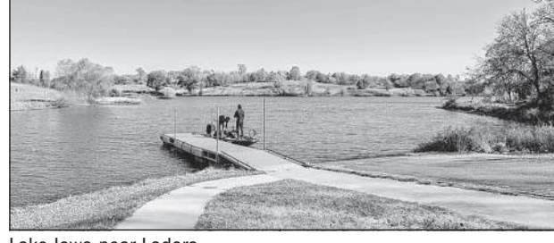
Lake Iowa near Ladora

Bluegill, good. Fishing is good, especially if you find the spawning beds. Don't pass up the edges