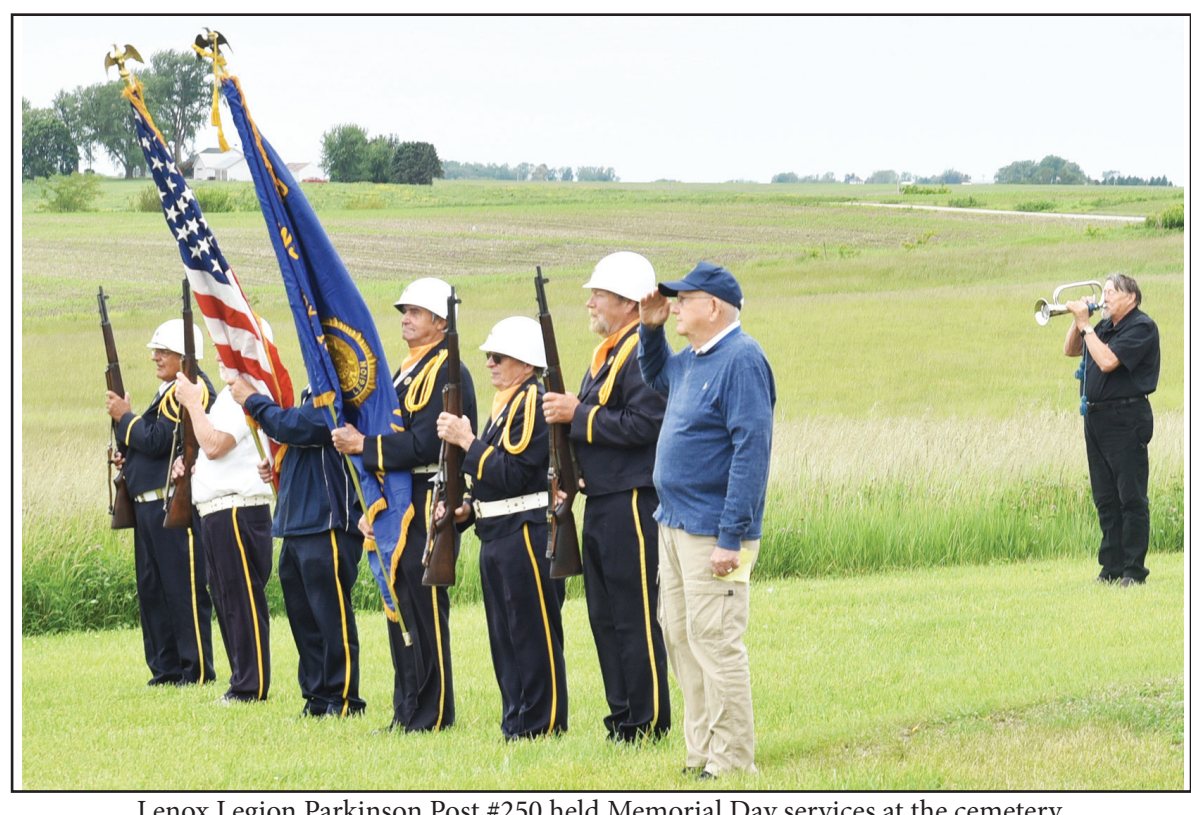
Lenox Legion Parkinson Post #250 held Memorial Day services at the cemetery.