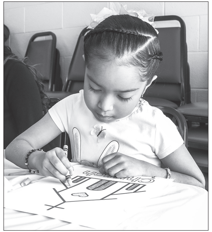
The Easter Bunny was the star of the day at State Farm's annual Easter Bunny Visit on Friday, April 18. The event was held at the Cherokee Community Center. It was a family event with lots of activities, photo ops and smiles.