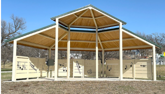
The new amphitheater in Chautauqua Park in Oakland.