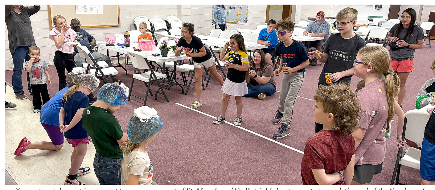
Youngsters take part in a carrot toss game as part of St. Mary's and St. Patrick's Easter party to mark the end of the Sunday school

Local pet owners wanting to share a photo of them and their pet are encouraged to send their pictures to The Journal-Herald for inclusion in the newspaper.