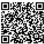
Download Our App!

Big show downs-playoff scenarios See Sports