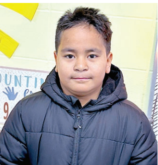
Today's Daily Smile is brought to you by Kinisou Weong!