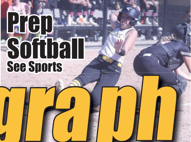
Prep Softball See Sports