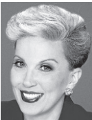
ABBY VAN BUREN

DEAR ABBY: Our son and his girlfriend had our first grandchild 18 months ago. We helped them move out of their rental house before the baby was born and buy a cute little house, which we made sure was in good shape before they moved in. (They had ruined the rental property with a couple of cats they had and their refusal to clean it at all.) We told them they had to keep the new house clean for themselves as well as our new grandson.