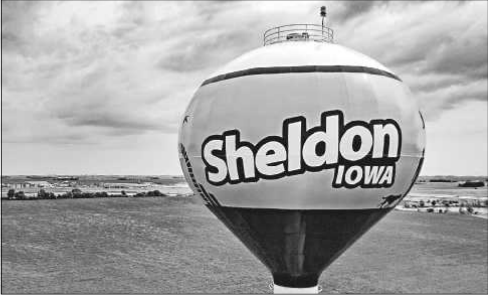
Sheldon's second water tower at Country Club Road and 16th Street features a black and orange paint job with the white lettering. (File photo)

The project will go out to bid on Feb. 13, and the council will award the project during its meeting scheduled for 4:30 p.m. Feb. 19.