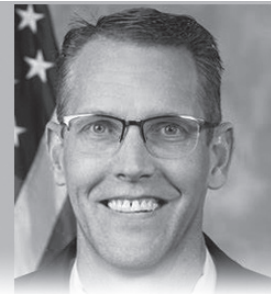
Rep. Randy Feenstra (R), Iowa’s 4th Congressional District

Rep. Randy Feenstra, (R), Iowa’s 4th Congressional District