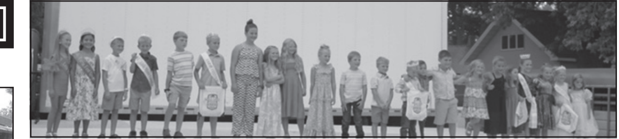
Pictured above are the contestants that competed for Little Miss & Mr, and Farm Fest Queen & King on Friday, August 8th. Located on the large stage.