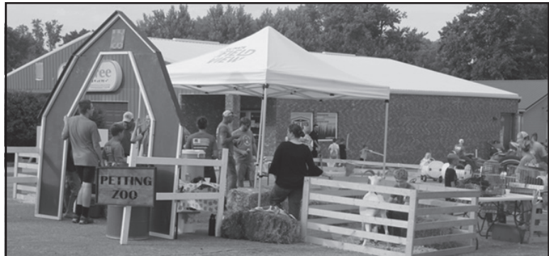
The Innovative Pioneers put on a petting zoo on Friday, August 8 for everyone to enjoy in Wall Lake.