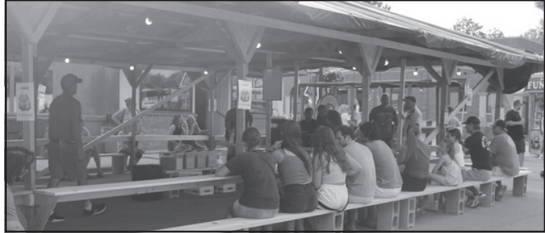
Bingo Anyone! Pictured above are the hopeful winners of the Annual Bing game at the Wall Lake Farm Festival.