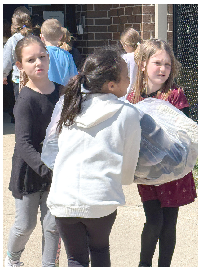
Students haul out the many bags of shoes that they collected during the drive.

"The shoe drive has become an annual tradition that we look forward to," said Perkins. "It's incredible