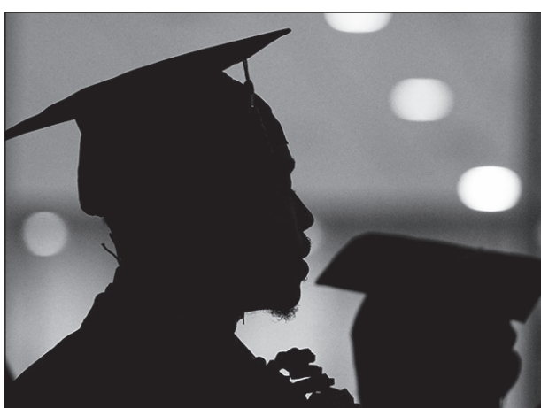
Morehouse College students line up before the school's commencement ceremonies in Atlanta on May 19, 2024.