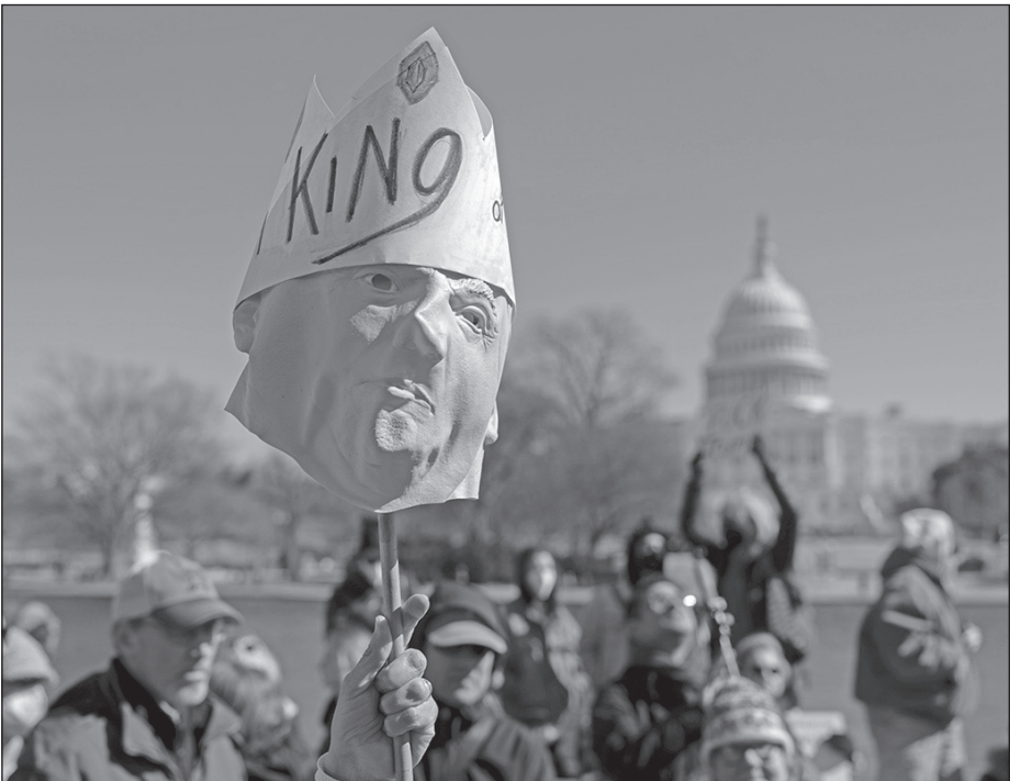
People take part in the “No Kings Day” protest on Presidents Day in Washington, in support of federal workers and against recent actions by President Donald Trump and Elon Musk on Feb. 17, by the Capitol in Washington.

Protests earlier this year have denounced Trump and billionaire adviser Elon Musk, the now former leader of Trump’s De-