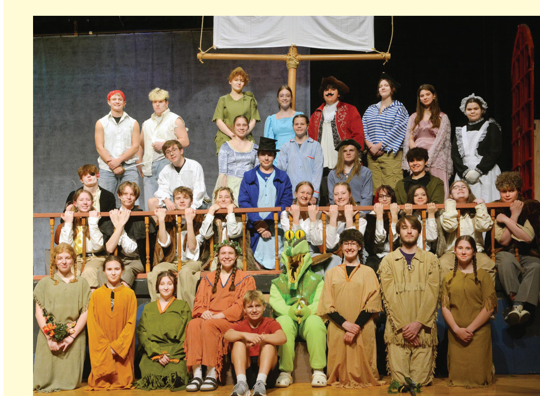
The cast of Humboldt High School's "Peter Pan", pose on the set of the ship. The play opens April 4 at 7 p.m. at the R. Wesley Carlson Auditorium. A second showing will be held on April 5 at 7 p.m. Tickets are available at Humboldt High School. To buy this photo and more from our gallery, visit our website at www.humboldtnews.com.