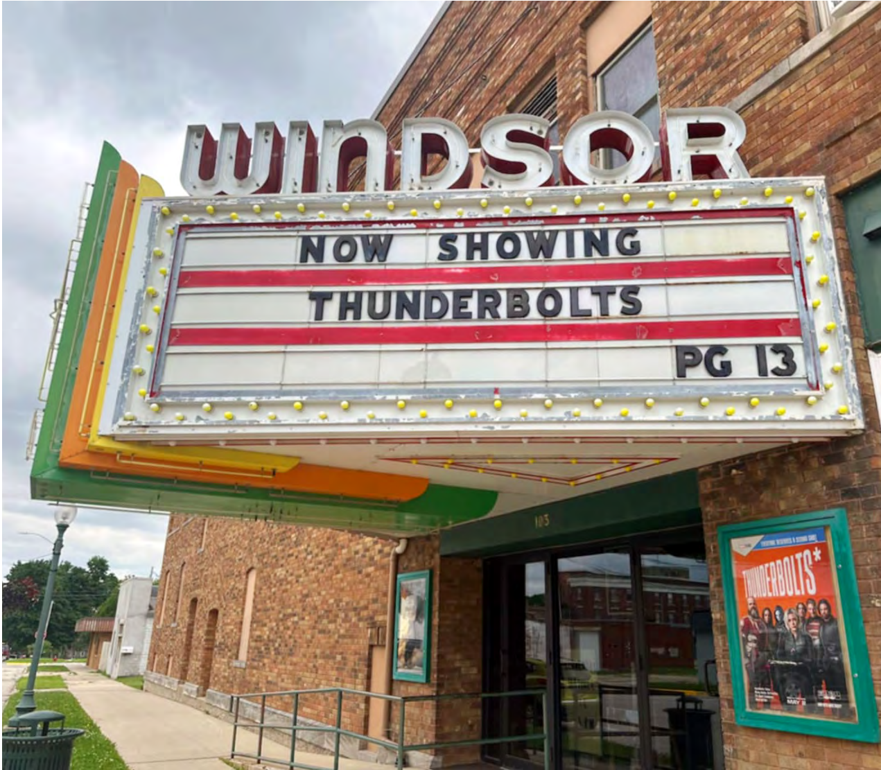
57 people attended Thunderbolts at the Windsor Theatre last weekend. Three more showings at 1 & 7 pm Wednesday and 7 pm Thursday.