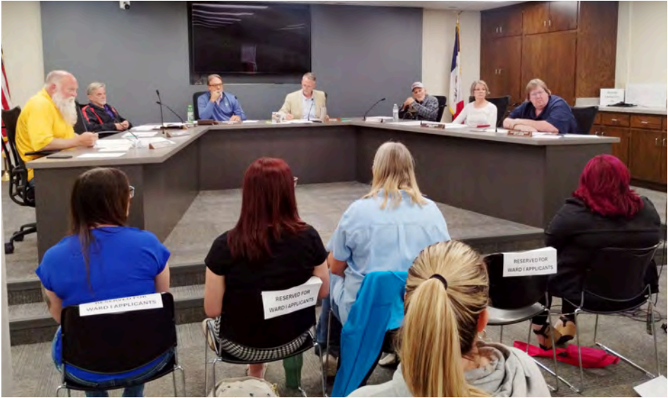
Ward 1 candidates during the June 9 city council workshop.

You can watch the entire meeting on the city’s YouTube page, @CityofHamptonIowa.