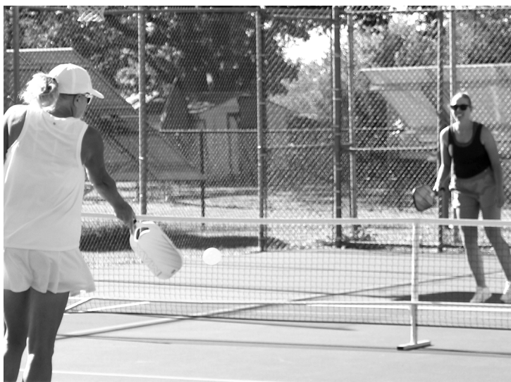
Above and below: Several people of all ages enjoyed playing in the Pickleball Round Robin games on Aug. 22 in Cresco.