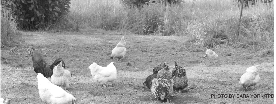
Chickens can be a great way to work up the dirt in the garden. They work hard and they even get rewarded with lots of bugs.

VISIT US ON- LINE AT WWW.CRESCO- TIMES.COM