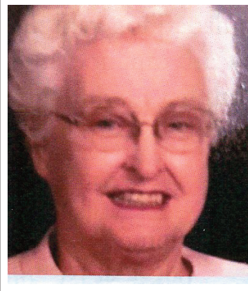
Feb. 1, 2025