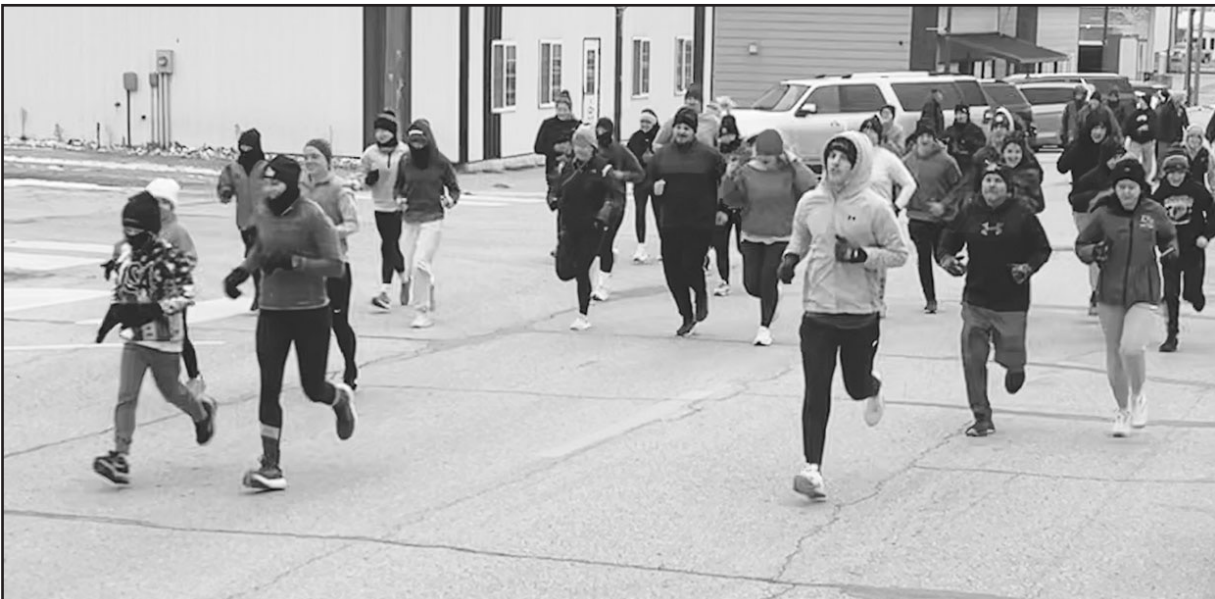
A large group of community members braved the cold and participated in the Turkey Trot on Thanksgiving morning. The Trot started at 8:00 a.m. and runners ran the 5K route on the streets of Armstrong. More than $700 was raised for the local food pantry. Organizers say they hope to make this a new tradition!