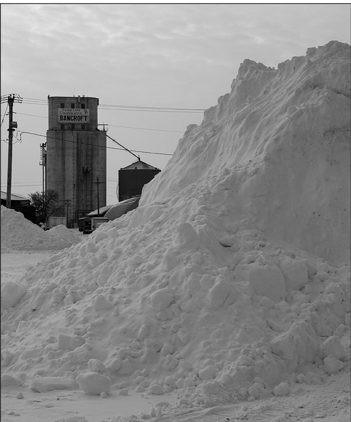
Piles of snow accumulated around the town of Bancroft and the area when almost a foot of snow fell over the Thanksgiving weekend.