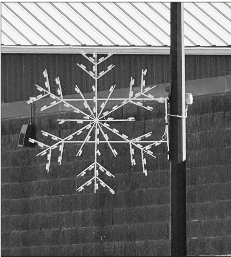
The light poles in Bancroft are now decorated with new snowflakes that light up the streets at night for the holiday season.