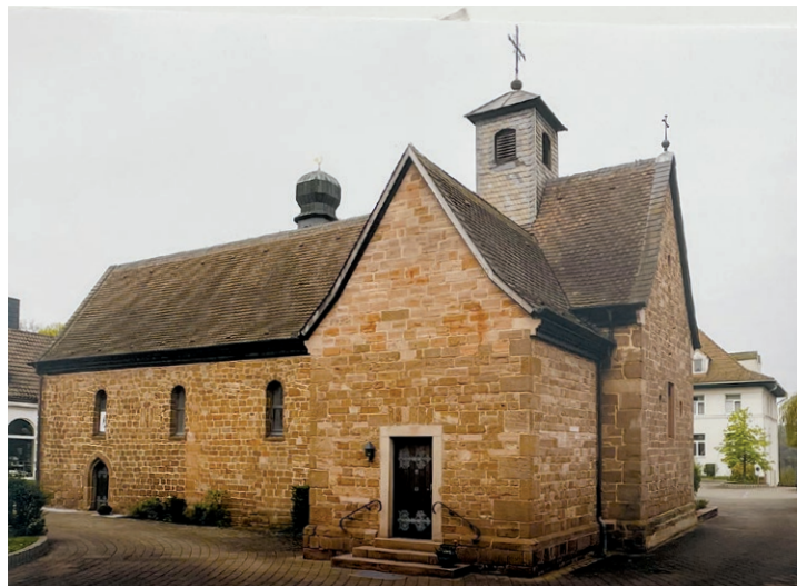
The old Grace Chapel, or "Gnadenkapelle", c.1150 AD. Maria Rosenberg Pilgrimage Shrine & Spiritual Center. Waldfishbach-Burgalben, Germany. The Third Order of St. Francis members worshipped here before immigrating to the United States in 1873.