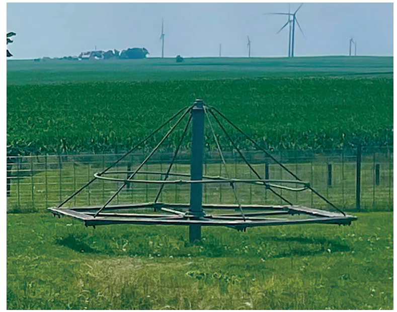
The merry-go-round from the St. Benedict school now sits in the pasture at the Bernhard farm.