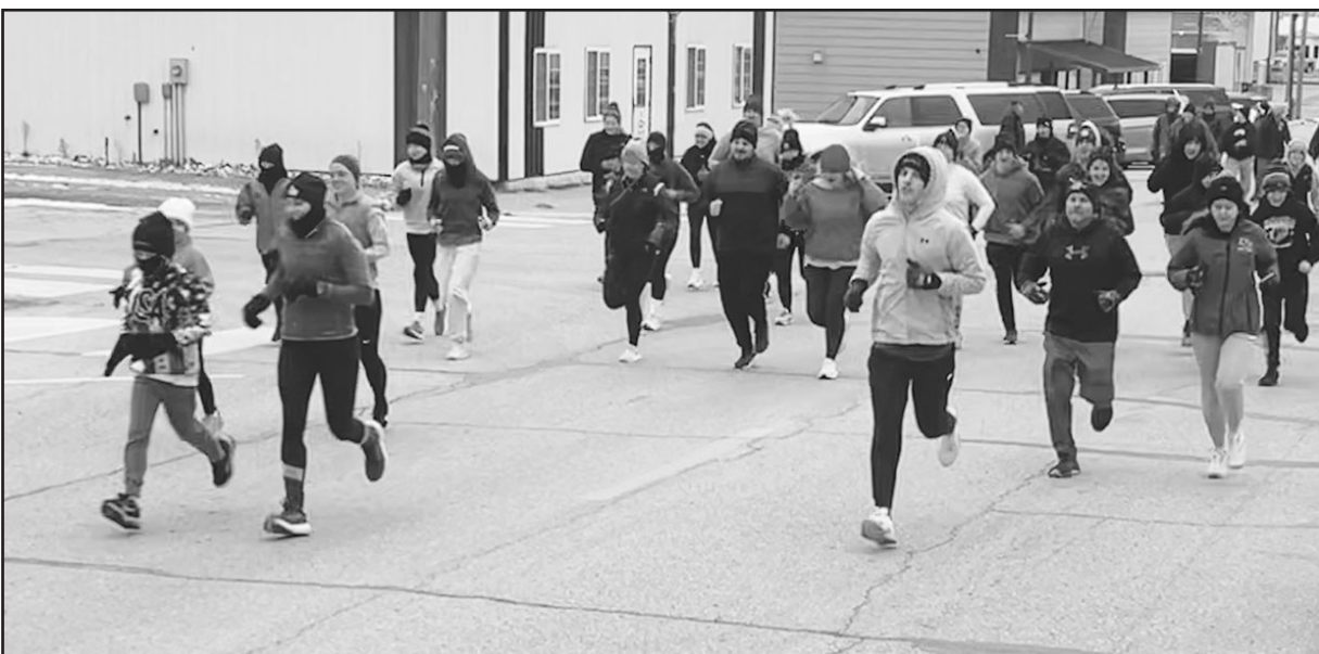
A large group of community members braved the cold and participated in the Turkey Trot on Thanksgiving morning. The Trot started at 8:00 a.m. and runners ran the 5K route on the streets of Armstrong. More than $700 was raised for the local food pantry. Organizers say they hope to make this a new tradition!