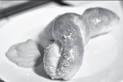
Try Gloria’s recipe for homemade soft pretzels. (Photo submitted)

Okay, I won’t be able to give you a recipe for Honey Mustard Dot’s pretzels, so we’ll go with our recipe for homemade soft pretzels. Use your imagination on seasoning to sprinkle on top before baking. They are not only yummy to eat, but also lots of fun to make, especially if you have youngsters to try their imagination on various shapes and letters. Our favorite was making special ones for Daddy. Enjoy them for yourself or those around you!