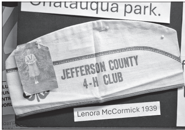
An artifact from Lenora McCormick from 1939.

members. Boys and girls belonged to separate clubs. The boys’ clubs showed animals while the girls’ clubs did home economics activities. Kistler mentioned that the Activities Building at the fairgrounds, built in the 1950s, was commonly referred to as the “Girls’ Building.” The display tells the story of how 4-H kids were recruited to harvest