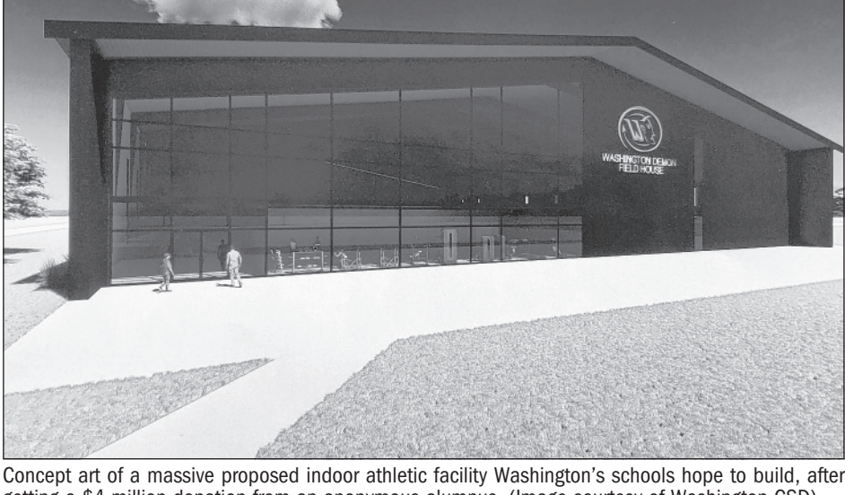
getting a $4 million donation from an anonymous alumnus.