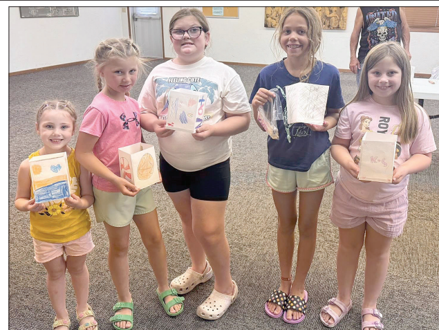
Today for craft club we made lanterns and popsicle stick puzzles! The kiddos did a wonderful job!!