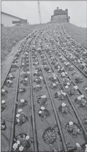
Brad Heald’s Mump Truck beside Highway 34, New London.

But Herschel isn’t satisfied with just hanging baskets. No. Across the street from his tire shop sits an old farm elevator, a dump truck, and a flower pole. The dump