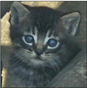
A close-up of one of the tiny kittens.

tives keep the lights on in rural communities across the country, particularly in Iowa. Encouraging students to understand and advocate on behalf of these critical member-driven cops helps advance energy security,” Grassley said. “I’m grateful these students are getting involved and learning about the important role electric co-operatives play in Iowans’ everyday lives.”