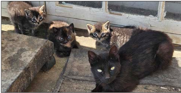
Unbelievably, I was able to take a photo where all three of the kittens and their mama were looking at me at once. That aside—just look at those cute faces!