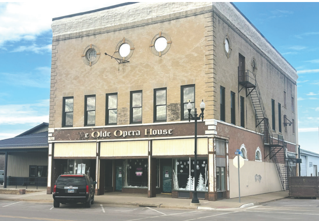
The Akron Opera House welcomes alumni of the All Class Reunion to its open house on Saturday, June 28, following the parade.

Opera House has also received several donations of show materials from over the years.