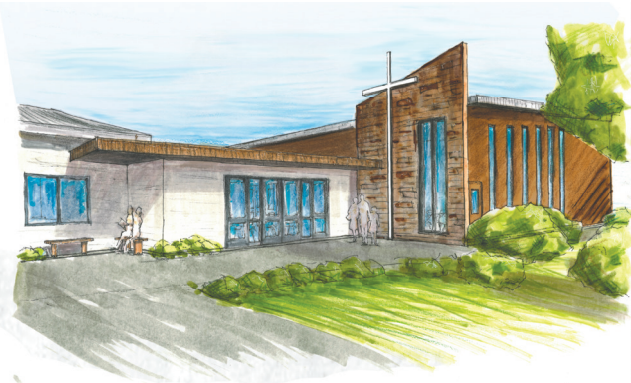
The addition of a patio is also a part of the planned expansion project at Akron FBC. Fundraising is ongoing, as the church works towards completing its three-phased project.