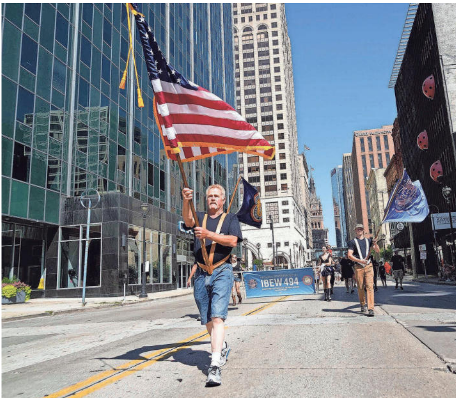
A member of Local IBEW-494 carries an American flag during the Labor Day parade in Milwaukee. The parade was put on by labor unions and union members of the Milwaukee Area Labor Council, AFL-CIO.